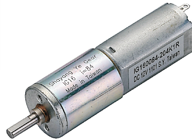
外形尺寸 APPEARANCE SIZE